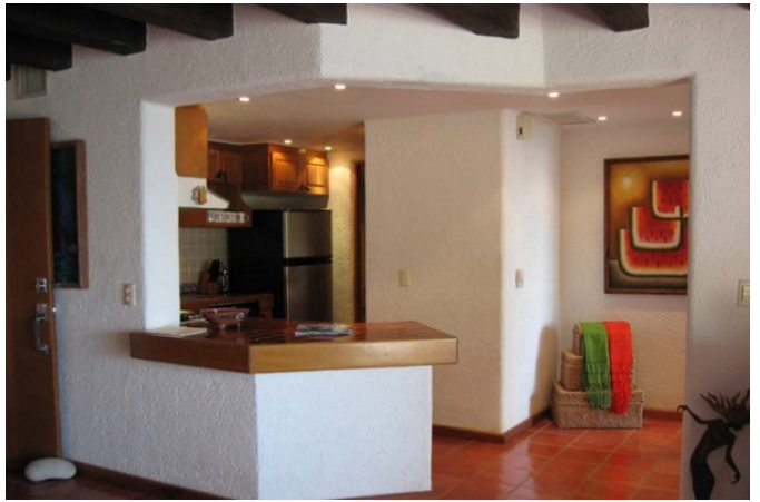
MLS Vallarta is a Real Estate Service offered by the Producciones Viva S.A. de C.V.