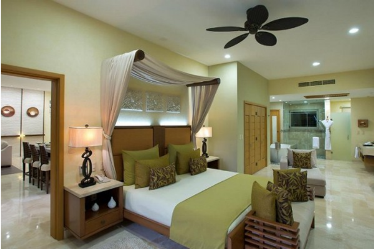
MLS Vallarta is a Real Estate Service offered by the Producciones Viva S.A. de C.V.